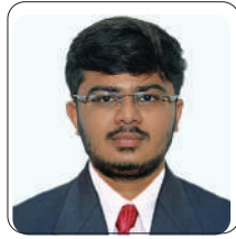
Arun A Bajaj Auto Limited, Pune CTC: 9.58 Lakhs