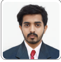
Shreyas U Megatechs Cold Forgings Pvt. Ltd., Bangalore CTC: 10.7 Lakhs